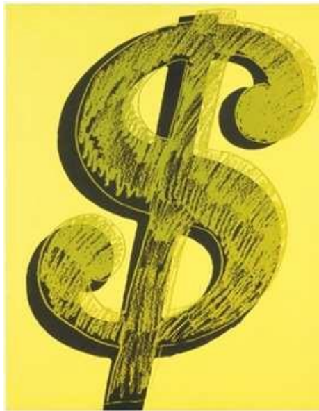
Andy Warhol Dollar Sign (1981) Sold at Sotheby's London, June 30, 2011 for £265,250 (premium) Estimate: £150,000-200,000

The ethics sessions provide a broad and rich introduction to the history of ethics as a branch of philosophy and its relation to visual culture and the ownership of art objects. Global ethical issues are discussed in the context of the contemporary art world and issues relevant to ethical business practice and corporate governance are explored. The ethics and law sessions are deliberately interwoven with the international art market sessions to enable students to: compare and contrast differing ethical/legal systems from a historical perspective and as essential features of contemporary cultures.