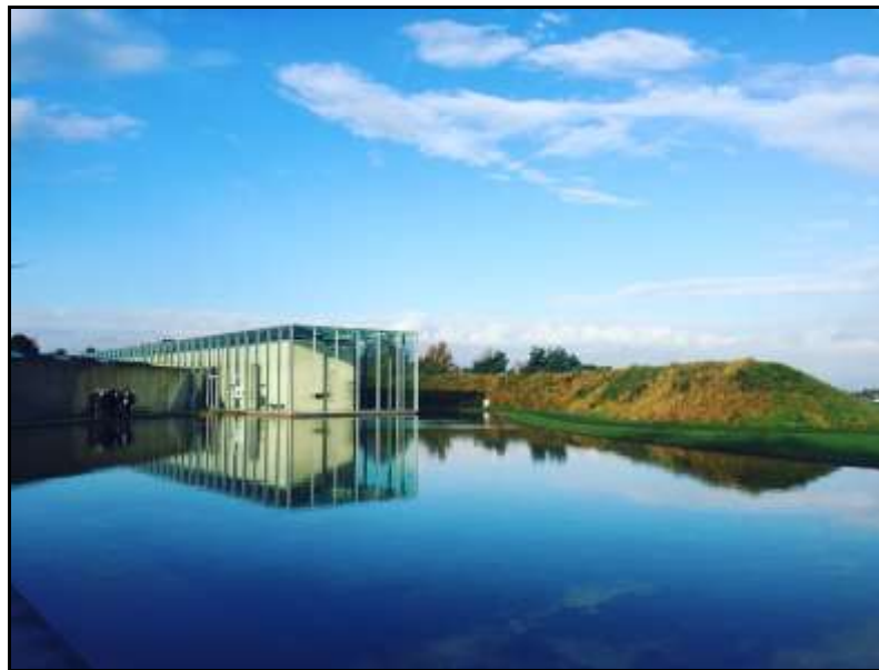
Langen Foundation, Neuss, Germany

During Semester I students also visit Sotheby's, where they are shown around by auction house experts.