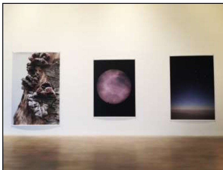
Wolfgang Tillmans, K21, Dusseldorf, Germany

The overall ambition of this unit is to ensure that all students can locate key movements in contemporary art history within appropriate historical, social, economic, and philosophical contexts. The unit pushes students to develop an understanding of how art objects circulate within networks of production, display and exchange. An over-arching concern here is for students to examine the globalisation of the art world and to gain a grasp of practices developed outside Europe and North America.