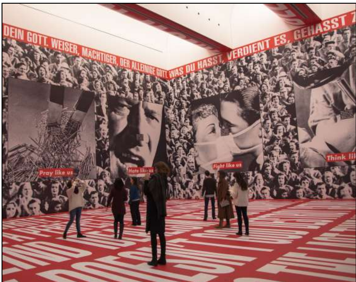
Barbara Kruger, Museum Ludwig

N.B. Transition to Semester III depends upon the successful completion of Semesters I and II. Students who successfully complete the first two semesters but are considered unlikely to complete a dissertation successfully, or opt not to write a dissertation, will be awarded a Postgraduate Diploma.