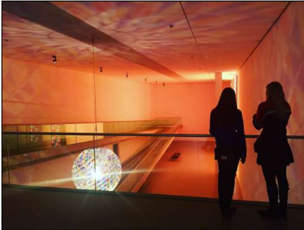
Olafur Eliasson, Langen Foundation, Neuss, Germany

Semester I is the most intensively taught of the three semesters. The aim is to give students a thorough grounding in the art of the period from 1968 to 1995 and to analyse the debates that attended it. The training received in this semester forms the necessary basis for the development of the student's own historical understanding and critical voice.