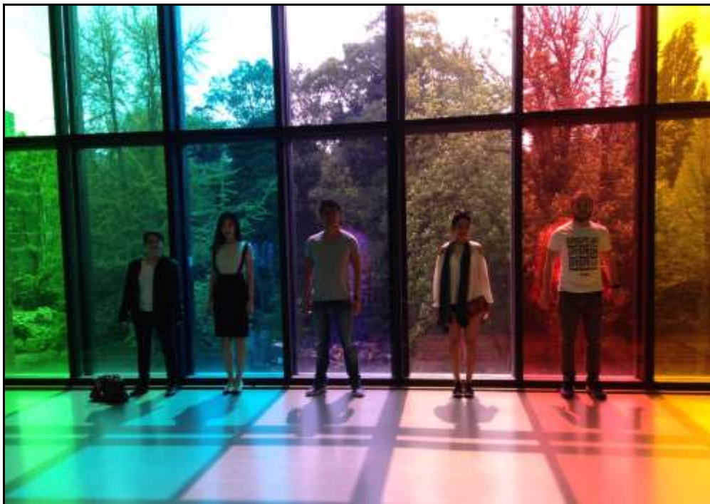
Ugo Rondinone – Vocabulary of Solitude, Museum Boijmans Van Beuningen, Rotterdam, Netherlands

Project: students undertake one of two projects. They can produce one issue of a hypothetical art magazine — in a print or web-based format — or present a proposal for a hypothetical exhibition in a commercial or publicly funded gallery. For the project, each student writes an illustrated critical essay of 3,000 words. Students work in groups to learn teamwork skills. (This project is part of the Core Curriculum; it is the culmination of the student's work on "Navigating the Art World".)