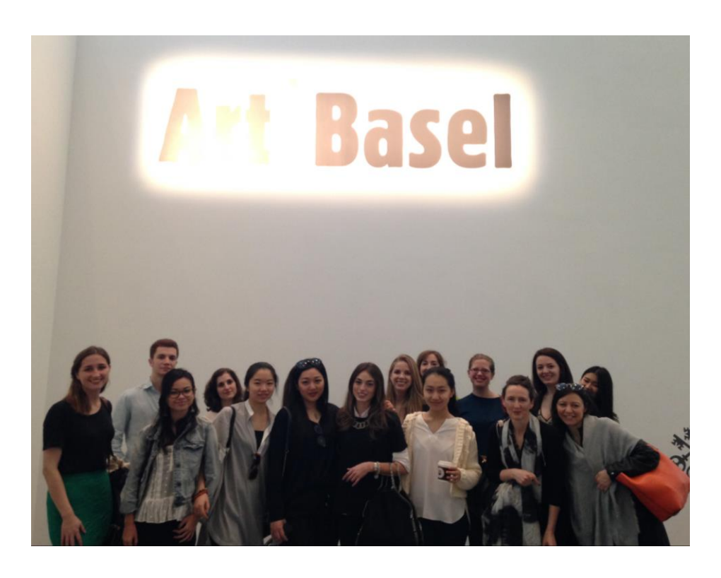
Students attending Art Basel Hong Kong