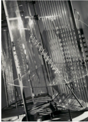
László Moholy-Nagy Lightplay: Black/White/Gray, 1930 Gelatin silver print The Museum of Modern Art, New York gift of the photographer (295.1937) © 2007 Artists Rights Society (ARS), New York / VG Bild-Kunst, Bonn

"I would also like to mention that we have an amazing Modernism Exhibit called: Modernism: Designing a New World 1914-1939. The exhibit runs from March 17 to July 29."