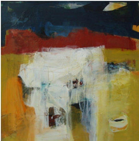
Anelle Gandelman Fine Art 1989 Palmer Avenue Larchmont, NY 10538 Gallery Hours: Wednesday- Friday, 10am-6pm Saturday, 12pm-5pm Also by appointment.